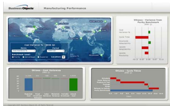
Figure 4: Sample Performance Dashboard

Plus, with Xcelsius Engage, you can easily embed your interactive dashboards and visual models in Crystal Reports, Microsoft Office documents, Adobe PDF, or any environment that supports Adobe Flash – with just one click. And they retain their interactivity, so your colleagues can interact with the information they need, with the tools they use every day.