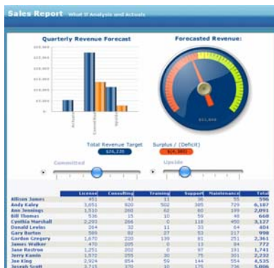
Figure 3: Sample Sales Report

With Crystal Reports Visual Advantage, you can use a comprehensive library of ready-to-use interactive charts, maps, gauges and sliders in Xcelsius Engage to transform your Crystal Reports data into interactive visualizations. The seamless integration of Xcelsius Engage with Crystal Reports enables report authors to quickly embed interactive charts and what-if scenario models into their reports without writing a single line of code. Crystal Reports Visual Advantage enables report consumers to interact with their report data in ways that were previously unachievable. They can take advantage of Xcelsius unique interactivity right within their Crystal Reports to access more report views instantly, or simply model the potential outcomes of their decisions and gain the confidence to take action.