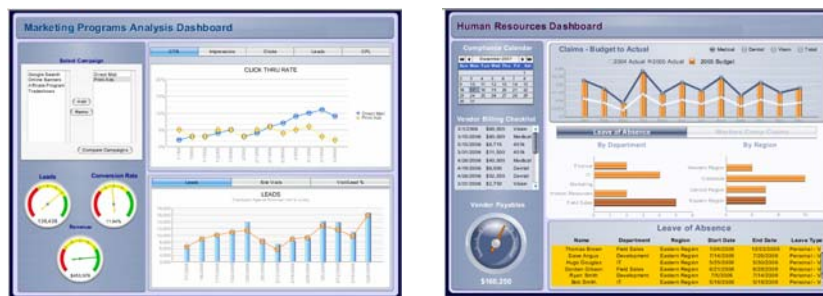
Gain Real-Time Insight into Your Business Performance via Live Dashboards

With today's rapid pace of business, large volumes of business data are locked within the silos of sophisticated disparate databases that are impossible for business users to access and tedious for IT to translate into intuitive visual presentations.